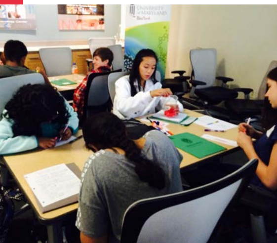
CTY parents and youth at IGS