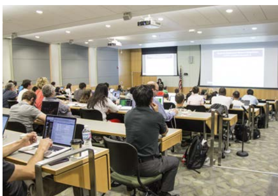
GRC hosts the PacBio Americas User Group Meeting on 6/17/15

It's been a busy few months in the Genomics Resource Center (GRC). We have installed and validated our new HiSeq 4000 system, which is capable of generating 1.5 Tbp of data every 3.5 days. That's enough to sequence 12 human genomes in one run! Initial results are promising and we are excited to roll this new platform into production. For more information, please see our blog . We have also taken delivery of a MiSeq Dx for clinical sequencing applications. Initially, using this platform, we will focus on two targeted gene panels, one cancer panel and one pharmacogenomics panel. Soon, we expect to expand through the addition of new panels and a HiSeq instrument for clinical exomes and whole genomes. Stay tuned!